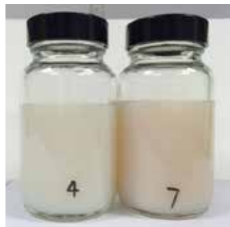
Figure 4. Color of AAEM latex

Sample 4: Latex containing 8% AAEM, 15 ppm of iron, and pH at 8.0 with 200 ppm EDTA added before neutralization