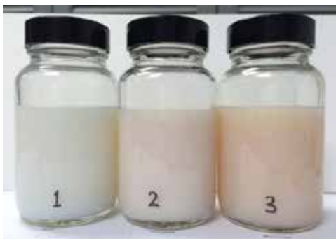
Figure 1. Example of yellowing of AAEM-containing latex

Sample 1: Latex containing 2% AAEM, 5 ppm iron content, and pH = 6